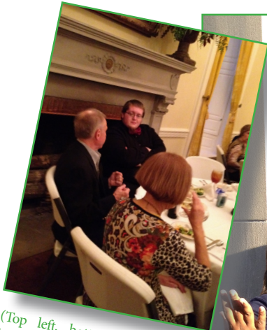
(Top left, bottom left and top right) SNATS members perform for and rub elbows with the Hartville Kiwanis