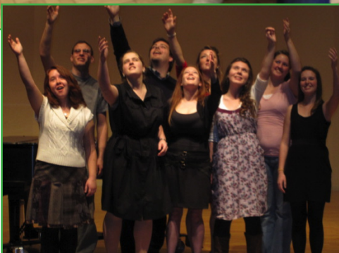
(Left) University of Montana SNATS members at NATS student auditions in Billings, Montana.