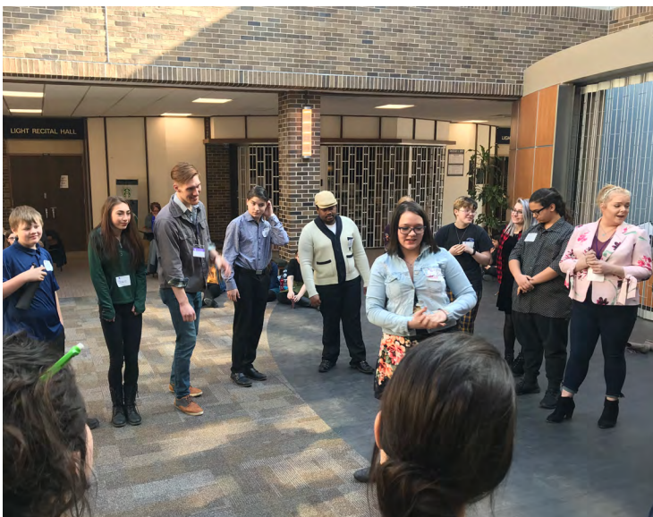
Ice breaker activity during lunch time at Voice Day.