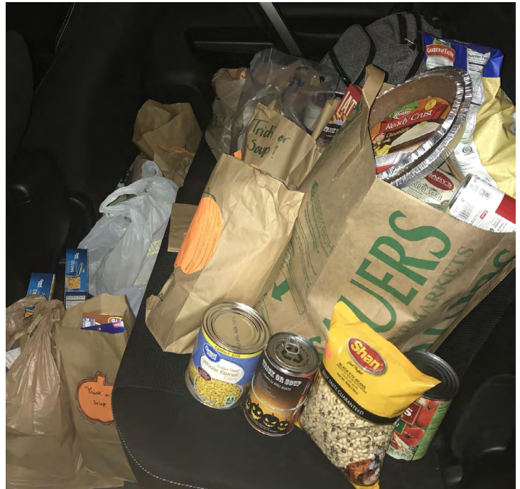
The photo of the food in bags ( above ) is from the Chapter's community outreach program called "Trick or Soup." Around Halloween chapter members canvass the neighborhood with flyers asking for non-perishable food donations. Community members are quite generous and all food collected is donated to the Community Action Center in Pullman.