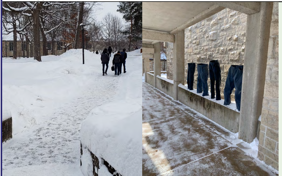
This won't happen at the Summer Workshop ... or will it?