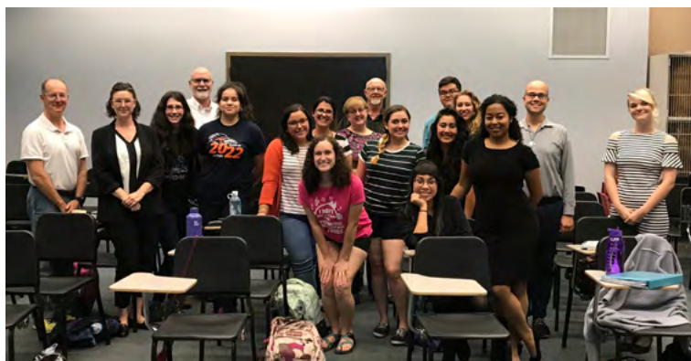
UTSA students worked on their audition presentation skills in a session led by voice faculty members..