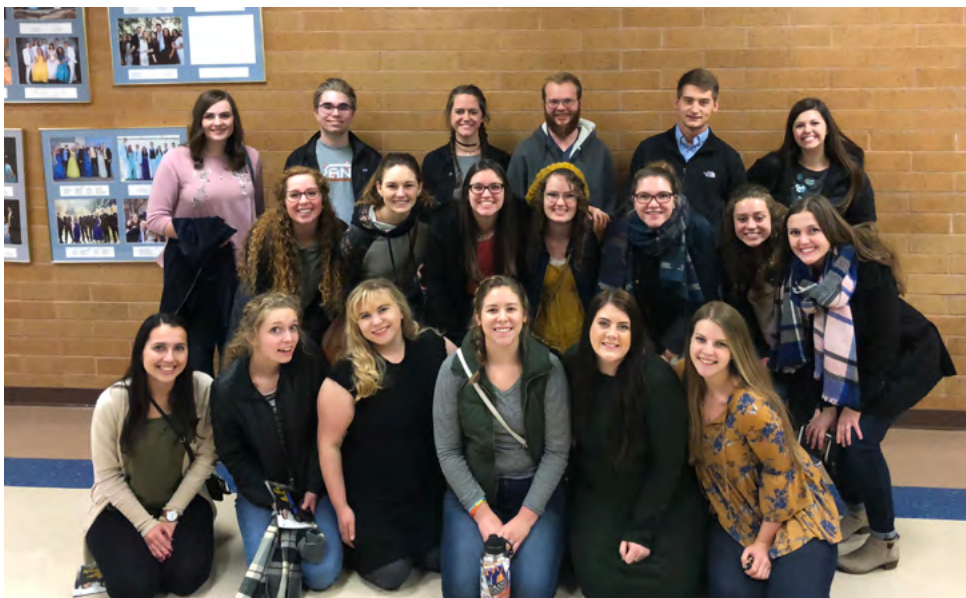
USU SNATS Members enjoying a night out supporting local theater!