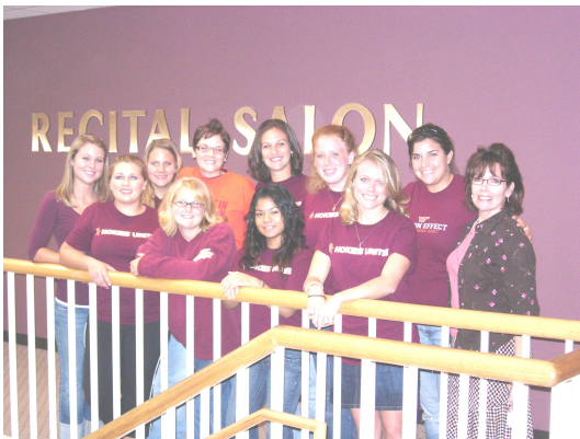
Virginia Tech SNATS members

We have had an enjoyable first semester as a Student NATS organization and are eager to offer many more educational and vocal experiences for our members, our department, and our university.