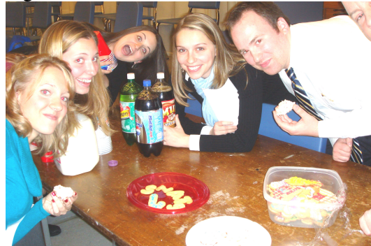
(Editor's note: The red plate contains cookies that spell out SNATS!)

On December 7, we just decided to have fun and sang Christmas music and ate cookies. It was a nice, relaxing time before we started finals. Some upcoming programs/workshops we are planning for the spring are: the Alexander Technique and how it can help singers; coaching – what it involves, how it differs from the voice teacher (demonstrations included); and healthy belting. We are excited to be a growing chapter offering relevant information to our members! Here are a few pictures from our Christmas get-together: