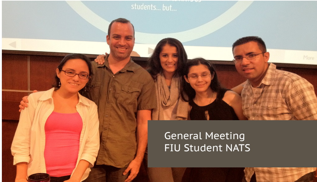
General Meeting FIU Student NATS