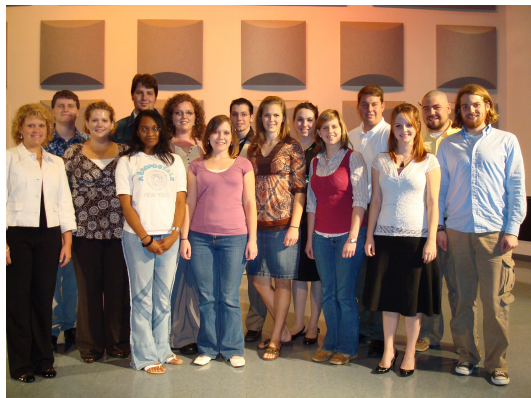
North Greenville University SNATS